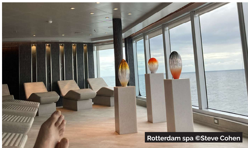
Rotterdam spa

There are paddles and balls for those who didn't bring their own, and the courts are open for impromptu games almost any time – except for limited hours