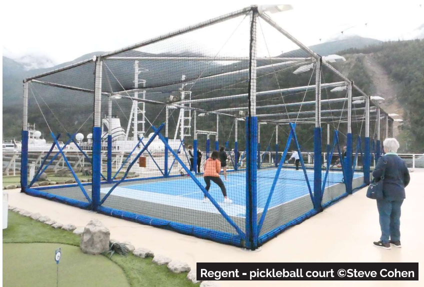
Regent - pickleball court

The two ships, cruise lines and itineraries were very different. The first trip was aboard Holland America’s Rotterdam to Scandinavia. The second was on Regent Seven Seas’ Explorer. As experienced cruise folks know,